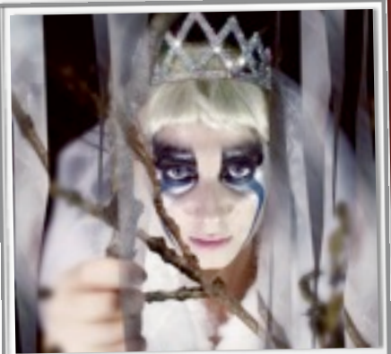
THE ICE QUEEN